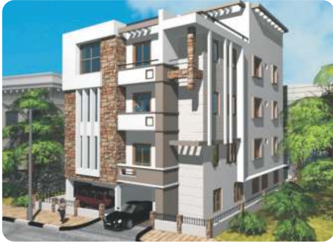
KVR - Kaumudi Residency