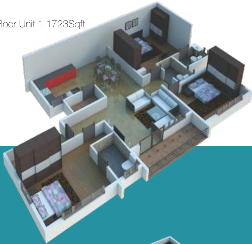
First Floor Unit 1 1723Sqft