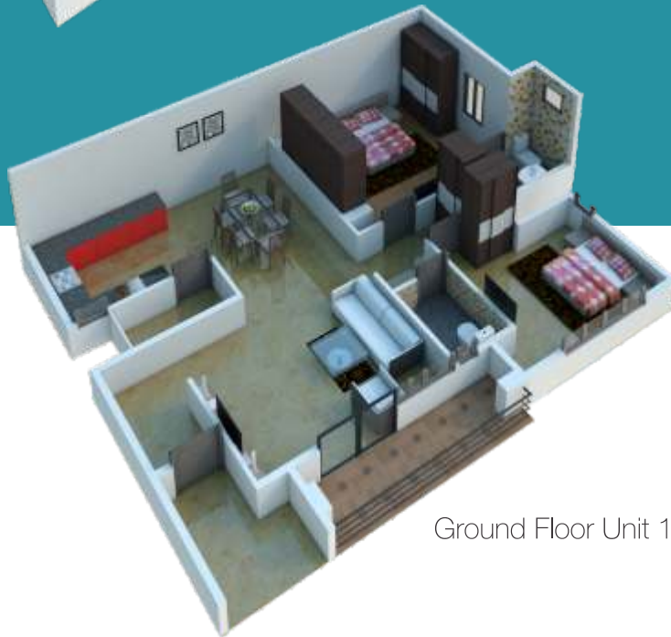
Ground Floor Unit 1 1796Sqft