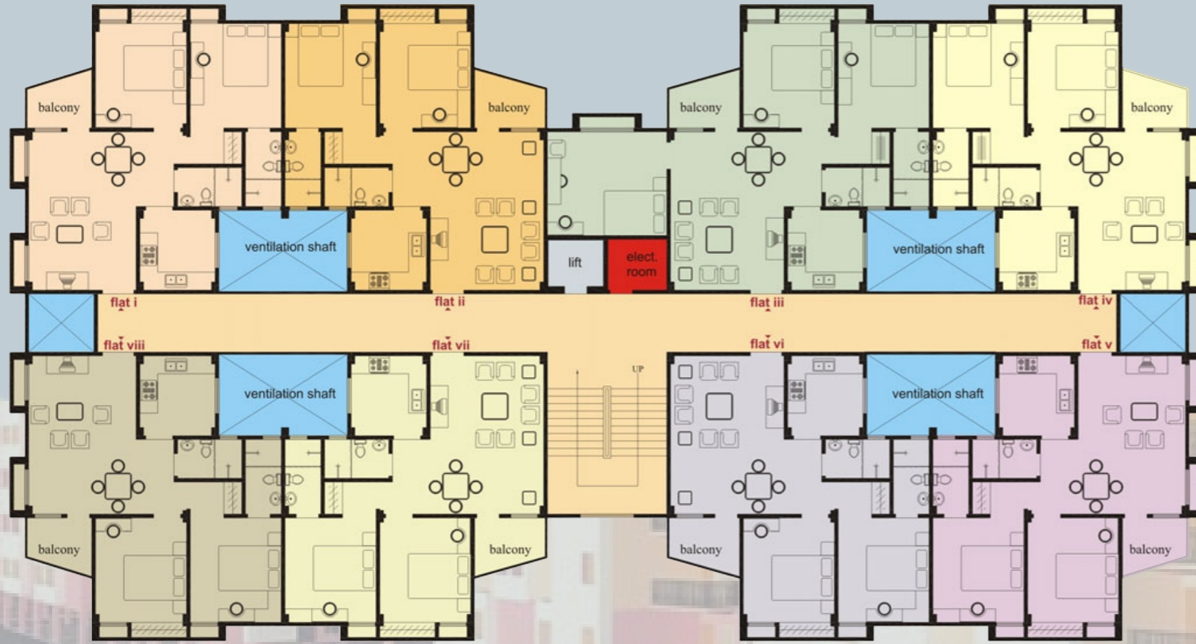
TYPICAL FLOOR PLAN FOR BLOCK "A"