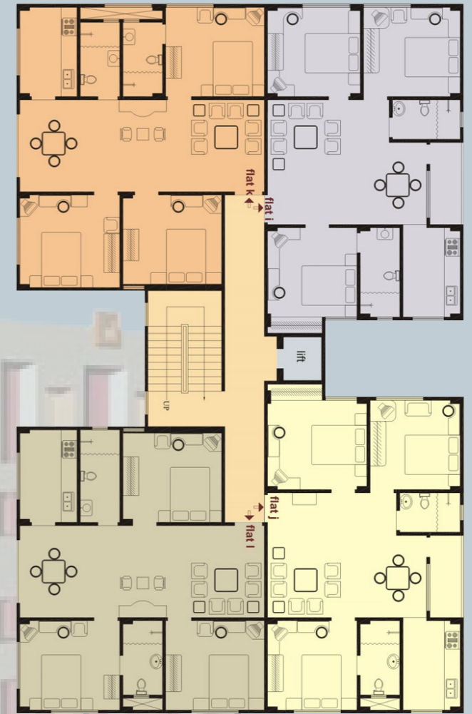
TYPICAL FLOOR PLAN FOR BLOCK "B", "C" & "D"