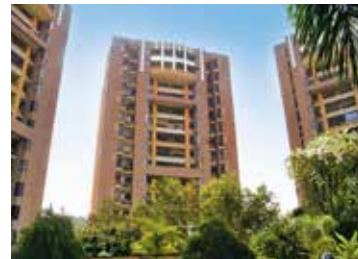
VIJAY ENCLAVE TOWER 1, 2 & 3