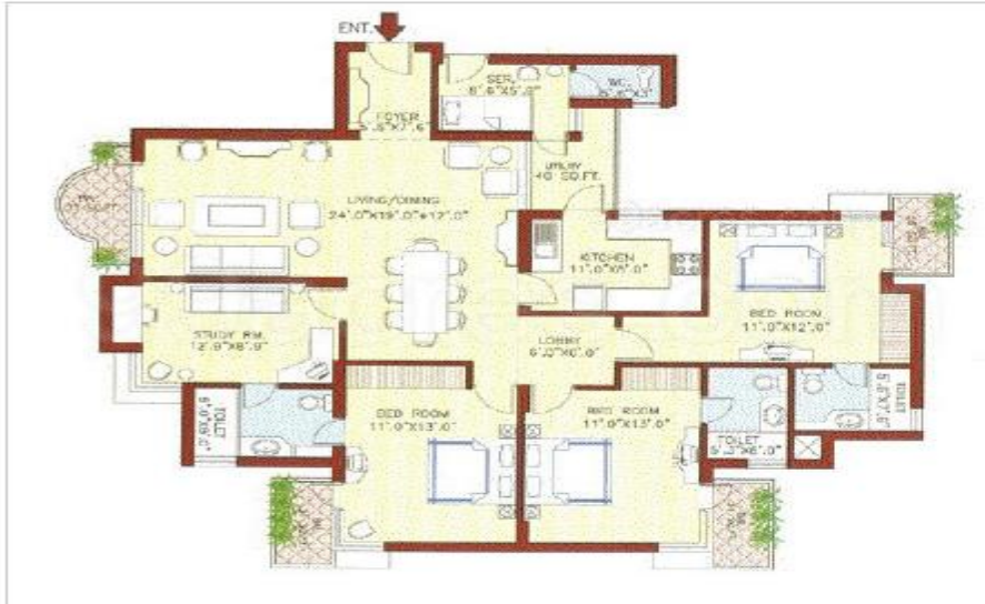
3BHK+4T+Study+Servant Room(3) Super Area: 1860 sq ft, Apartment