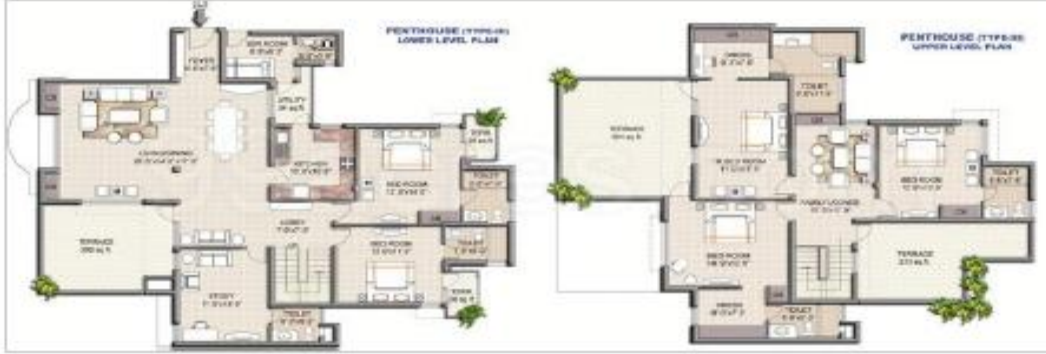
5BHK+5T+Servant Room(8) Super Area: 3383 sq ft, Apartment