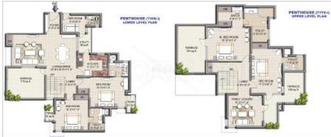
4BHK+5T+Servant Room(6) Super Area: 2577 sq ft, Apartment