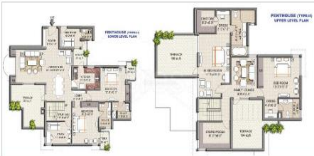
4BHK+5T+Pooja+Study+Store+Servant Room(7) Super Area: 2846 sq ft, Apartment