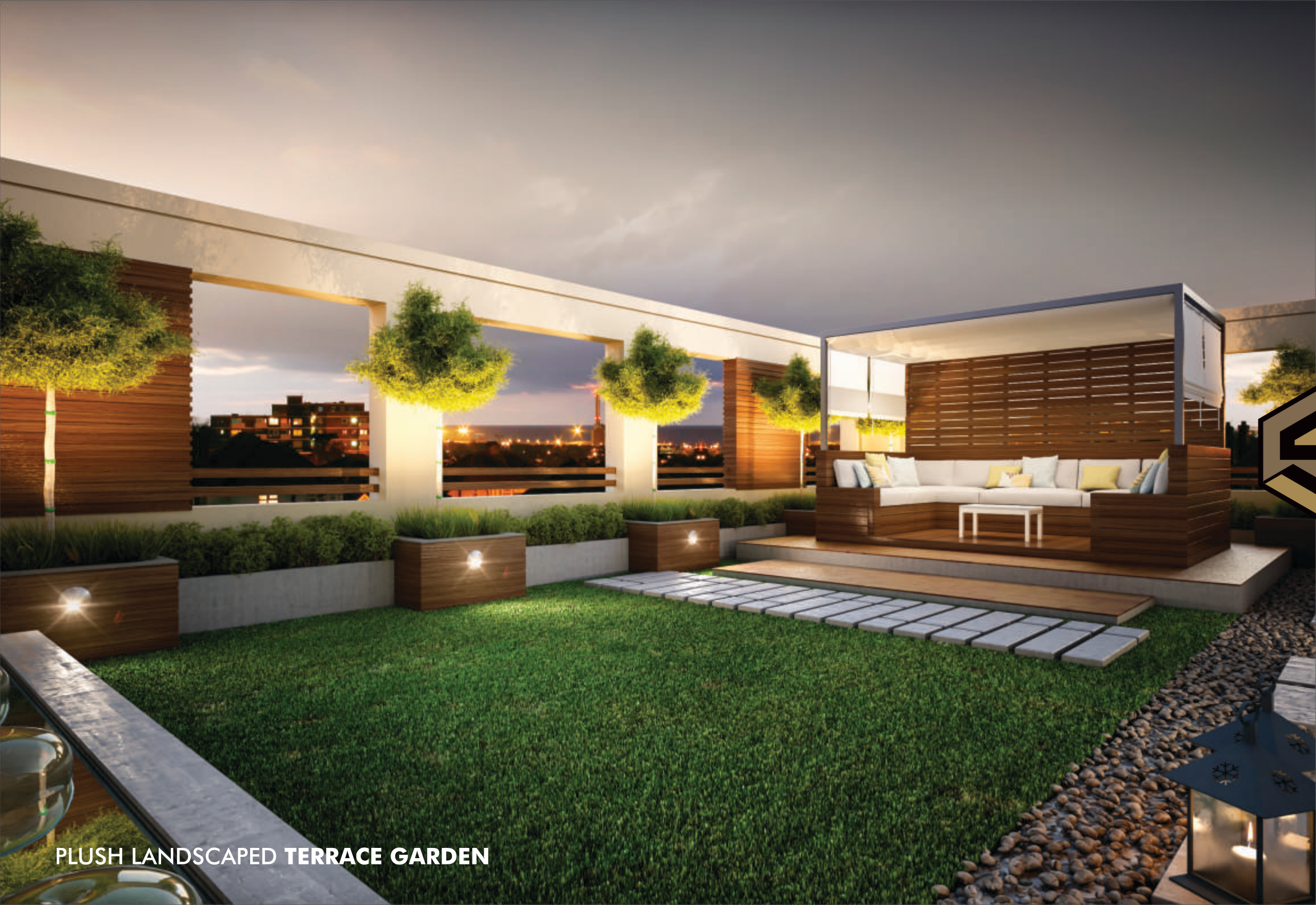
PLUSH LANDSCAPED TERRACE GARDEN